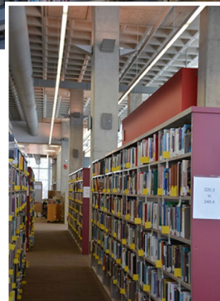
The Recessed Linear Metalumen Grande