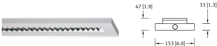
RMEC 1-T5, SL-Specular parabolic louver

Ceiling mount with specular parabolic louver offers a glow of light along the ceiling plane.